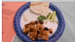
Pictures are from the 6th Grade Family Seder (Passover Meal).

The Religious Education Program is sponsoring a Fundraiser of Fannie May Candy Bars on May 13th & 14th after all the Masses. This fundraiser is to help with the cost of the sign for the Religious Education Office. Thank you for your support.