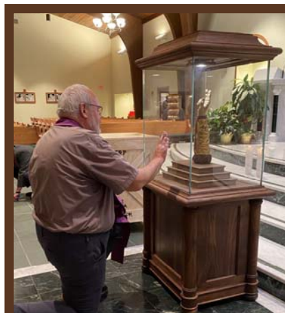
Pastor and the Apostle (St. Jude visit to Saint Gilbert September 12th, 2023)

Excerpt from the Lectionary for Mass ©2011, 1982, 1970 CCC.