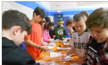
The picture is from the Family Program.

Families have a choice as to the program that would best fit into the family schedule and desire. The Family Program is an alternative for Families