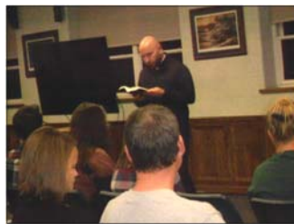
The picture is from the Parent meeting for the Sacrament of Reconciliation.

of Fannie May Candy. Materials may be found at the entrances to the Church. Simply place completed forms in the labeled boxes at the entrances to the Church. Deadline for orders is October 29th. Thanks for helping to fund Religious Education Classes for our young members.