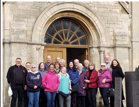
Photo from Sempringham Abbey — the historic place where St. Gilbert's remains have lain buried near the altar for over 800 years.

... Over the years a special custom grew up in the houses of the Gilbertine order called “the plate of the Lord Jesus.” The best portions of the dinner