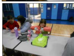
The pictures are from the Family Program.