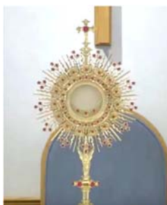
EUCCHARISTIC ADORATION Wednesdays, 9am—9pm Saint Gilbert Chapel