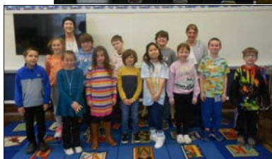
Class pictures from this year...

CATECHISTS BRUNCH... The Catechists and their families are invited to a brunch following class on May 5th in the Parish Center. I am so grateful to have dedicated people sharing their faith with the young members of our Parish Family. May God bless you always!