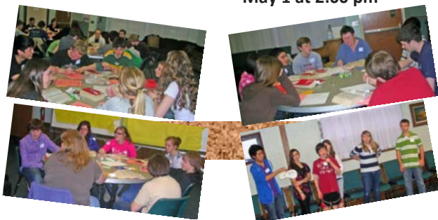
Pictured are students participating in the Grades 7-9 Retreat — 'Running with Jesus'.